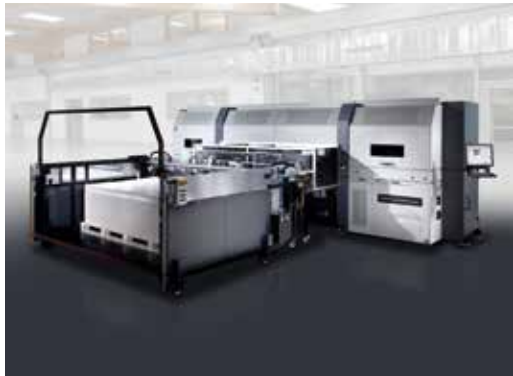
Rho 1312/1330 > Page 10