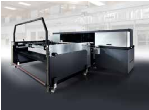
Rho Rho P10 200/250 HS Plus > Page 12