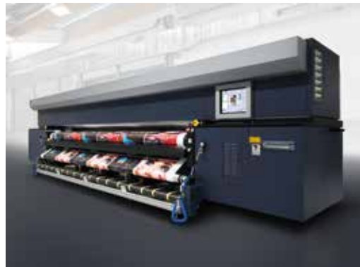
Rho 512R Plus