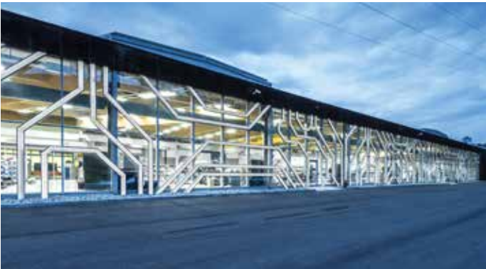
Durst location in Brixen, Italy

Durst is a world-leading manufacturer of advanced digital production technologies. In its active business areas, Durst is the first choice and a preferred partner for the transformation and digitization of industrial production processes. Durst is a family-owned company with 80 years of history in which innovation, customer focus, sustainability, and quality have been – and remain – its core values.