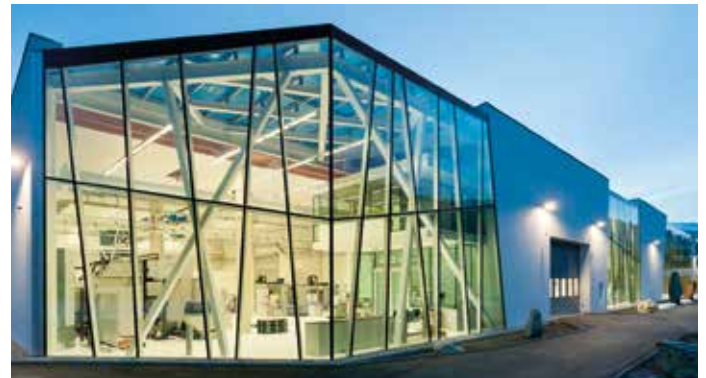
Durst location in Lienz, Austria