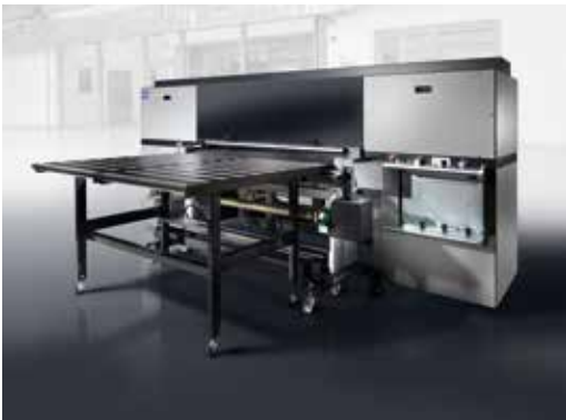
Rho P10 160 > Page 15