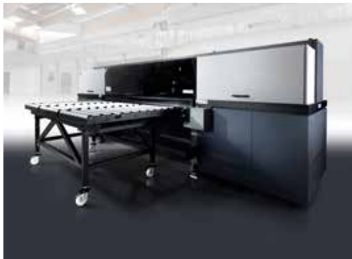
Rho P10 200/250 > Page 14