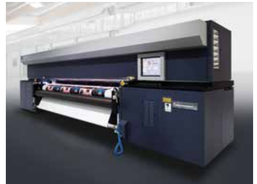
Rho 312R Plus