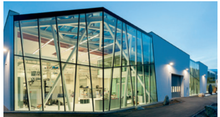
Durst location in Lienz, Austria