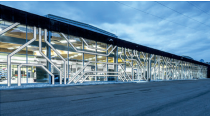
Durst location in Brixen, Italy

Durst is a family-owned company with an 80 year history of values focused on innovation, customer orientation, sustainability and quality.