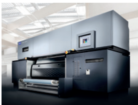
Rhotex 180 TR

With the new Rhotex 325, the Rhotex Series has now implemented an efficient high-end production process, to increase cost effectiveness, confirming its role as European market leader, and expanding its global position.